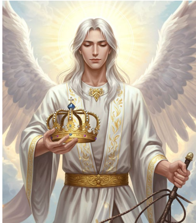
The Angel Jeremiel

This newsletter is for you, so we are eager to receive your feedback. Do you like it? What would you like to see it cover? Or just your feedback.